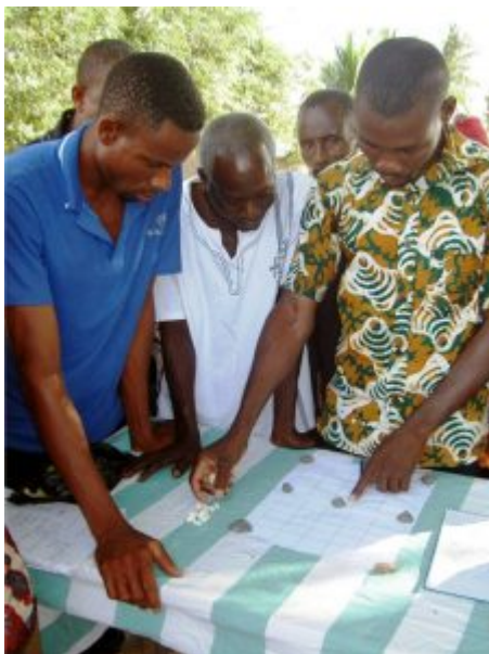
Participatory consultation, Burkina Faso

Inadequate logistics was highlighted as a major issue by the vaccinators using the three different protocols in both countries. For the most part, the amount that the breeders contributed to the vaccination costs was not considered to be a major issue by the farmers or the vaccinators. However, a farmers' lack of ability to pay his dues at the time of vaccination is often an issue and this is directly linked to the organisation of the campaign (the vaccination period,