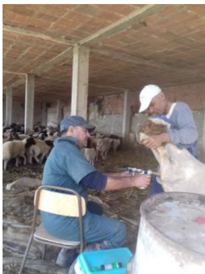
Private veterinarian who holds a sanitary mandate vaccinating livestock against FMD in Béja Governorate.

The implementation of the sanitary mandate has been successful in many areas and the results are considered satisfactory. This is a practical way to ensure the sustainable delivery of veterinary service activities.