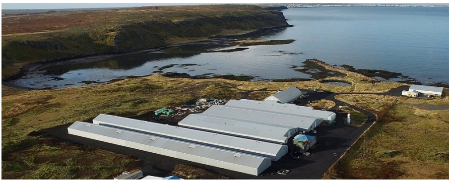
Vogar, Iceland.

The views expressed in this article are solely the responsibility of the author(s). The mention of specific companies or products of manufacturers, whether or not these have been patented, does not imply that these have been endorsed or recommended by the OIE in preference to others of a similar nature that are not mentioned.