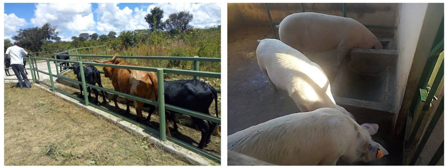
Some photographs from the African Development Bank-funded Livestock Infrastructure Support Programme (LISP) in Zambia. Left: a vaccination crush in Nakonde; right: a feeding and drinking trough in Kasama.

The bank's governance strategy and action plan have always stressed the importance of strengthening PPP policy, legislation and regulatory frameworks to aid in developing livestock infrastructure in Africa (e.g. dip tanks, crush pens, vaccination crushes, feeding and drinking troughs, veterinary laboratories, etc.).