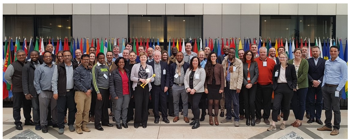
The 2020 LD4D Community of Practice meeting was hosted by FAO in Rome from 4 to 6 February 2020

All outputs will be published via livestockdata.org, the community's data and evidence hub.