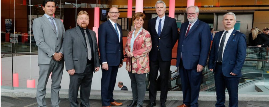
African Swine Fever Forum, Ottawa, Canada, 30 April – 1 May 2019.