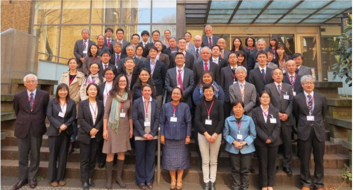
Meeting for OIE Reference Centres for Asia and the Pacific, Tokyo, 12 March 2019

The main objectives of the meeting were: