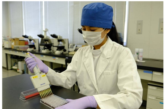
Haemagglutination inhibition test at the quarantine

One hundred and four of the 114 horses had pyrexia and/or nasal discharge. Five horses died in the quarantine period. However, the remaining infected animals recovered quickly and the experimental challenge of five naïve yearlings did not indicate that this virus was unusually virulent.