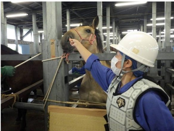
Collection of nasal swabs

In Japan, the Animal Quarantine Service diagnosed 114 stock horses imported from Canada as positive for equine influenza. All of the imported horses had been vaccinated twice with a five-week interval. The second vaccination was administered 10 days prior to departure. The vaccines had not been updated in line with OIE recommendations and included the old American lineage strain, A/equine/Kentucky/1/1997.